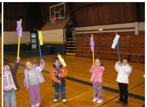
The paper lanterns light the way. See More Pictures Below