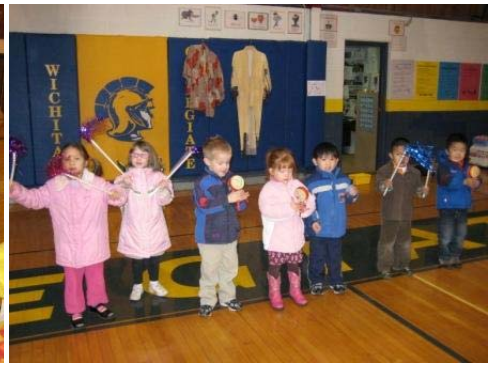
Next came the noise makers and the pretend sparklers.