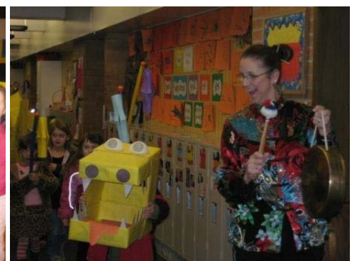
Our parade went through the halls and outside.