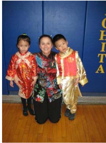
Some students and teachers came dressed for the celebration.

Studying the Chinese New Year was so much fun. We hope you enjoyed our pictures of this very special event.